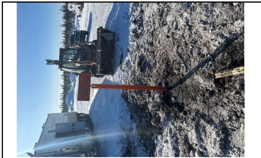
Sign placed on north side of the wellhead and facing north