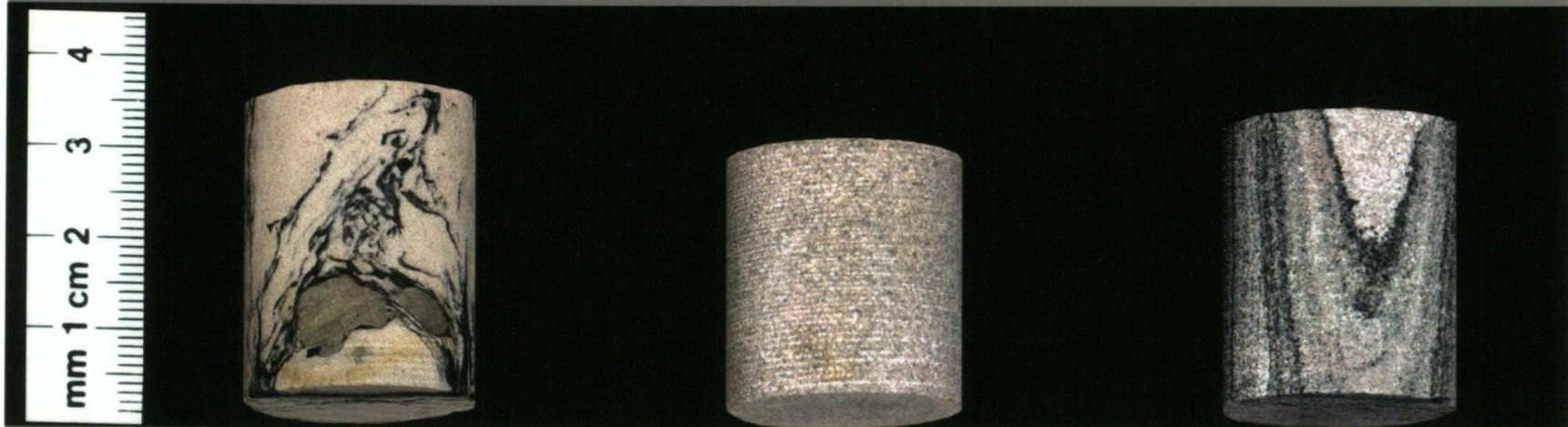
SWP 1 721.00m